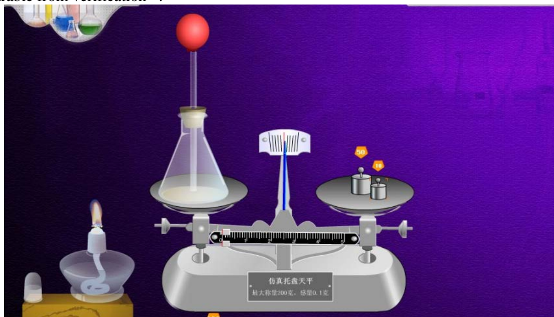
Figure 2 Determination of mass before and after white phosphorus combustion

but it is worth noting that the verification process is full of inquiry, and the process of inquiry is inseparable from verification [5] .